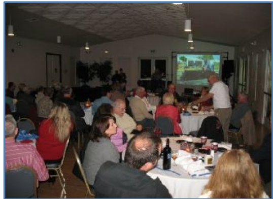
The Main Dinner Hall filled with our favorite folks who all love our favorite things: Trains and food!

Only one complaint can be logged with this year’s dinner: many wish that more members could have attended. See you next year!