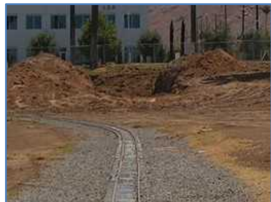
What used to be the South Portal of our tunnel is now a piece of RLS history.