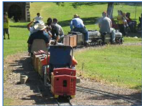
The current tunnel by-pass begins just south of the Iowa siding, mid-way along the old tangent that headed into the North Portal (Upper left).

During August 2010, the park contractor removed the tunnel, and after more than 50 years, its life ended: May the tunnel rest in peace forever.