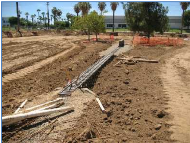
We were worried that we might lose our trestle. But the city and contractor assure us everything will be okay.