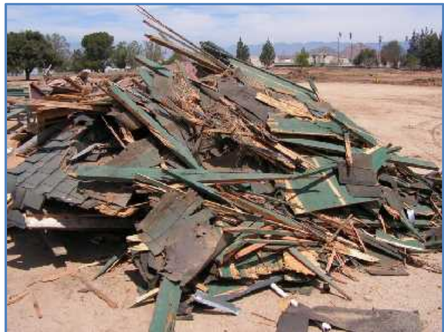
This is what is left of the Columbia Station awning.