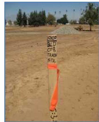
It reads, "Building Corner, Train Station". It's happening, folks!

As for the Park's reconstruction project, we're still in the deconstruction phase, but things are moving along rapidly. The Contractor has already finished about 60% of our new access road from Marlborough Ave., and has done the majority of the grading for our new parking lots and new Iowa station. However, before much more can happen, several large drainage pipes, electrical conduits, and irrigation pipes have to be installed. Whenever possible, the construction crews will utilize a tunneling machine when needing to pass under our mainline. But, there will still be times we will need to remove a panel or two so they can pour the concrete pathways. We will be building about 20 new, steel-rail panels specifically for these crossings and will work closely with the contractor during their placement.